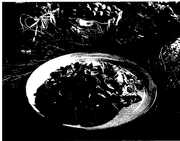
Recipe and photo compliments of Georgia Pecan Commission

*Note: Toast sesame seeds in a clean, dry heavy skillet over low heat. Stir constantly until seeds just begin to darken.