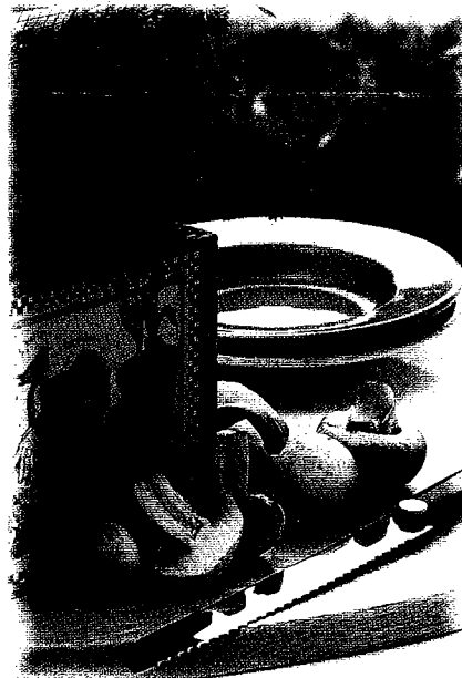
Here are some good tips for handling food safely.

Wash hands and any kitchen objects such as plates, glasses, utensils and all work surfaces with hot soapy water both before and after use. Serve meats, poultry or seafood on a different plate than that which was used to marinate. Use a thermometer for measuring internal temperatures of cooked foods. Cook eggs yolks until they are white and firm. Cook microwaveable foods thoroughly by covering and rotating the dish whenever possible. Bring sauces, soups and gravies to boil. Refrigerate or freeze leftovers within two hours. Boil leftover marinade before basting with it. Keep cold foods cold and hot foods hot. Divide large amounts of hot foods into smaller containers so that they will cool faster when placed in the refrigerator. Keep refrigerator thermostat below 40 F and freezer temperature at 0 F.