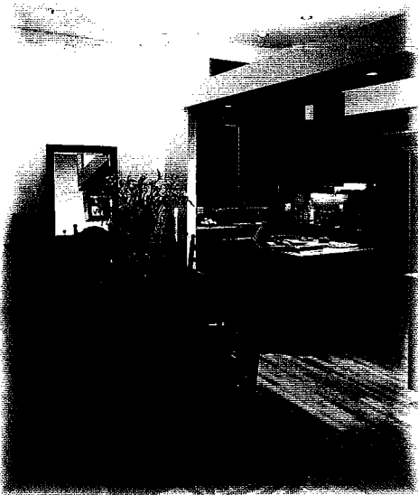
Everything contained in your home and on your property is considered household inventory.

What is included in a household inventory? Every item you or other household residents own that is in your home or stored in structures on your property, such as the garage, is considered household inventory.