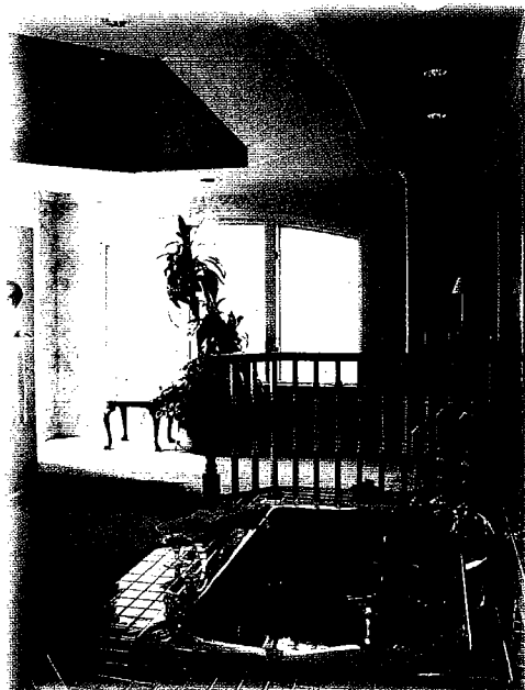
Research home warranties before purchasing.

Most programs cover major systems; air, heat, and plumbing, as well as built-in appliances such as water heaters, dishwashers, jacuzzis and ovens. Not every contract includes the roof, foundation or other structural materials. It is important not to confuse a home warranty with hazard insurance. Your hazard insurance takes care of items that have been